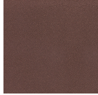
Rusty Rush - 10