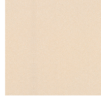
Lagoon - 06